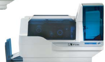
P330i with optional 220 card input hopper